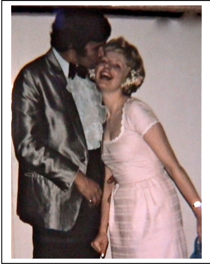
First night party Johannesburg when Cupid decided to act!